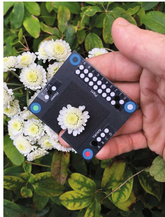
Fig. 2 An example image using a SpotCard. The SpotCard can be used at any rotation angle, allowing for easy positioning. Note the tape, to make the spots wipe-clean, and the matt black card behind the flower, reducing reflections which interfere with flower size detection

Photographs of plants can include the SpotCard in any orientation. The only constraint is that the SpotCard must be photographed facing directly towards the camera, as the detection macro does not apply any affine transformations to the detected images. However, spot data are still processed correctly even when the SpotCard is tilted up to around 18 degrees around any axis; in practice, it is simple to hold it flatter than this.